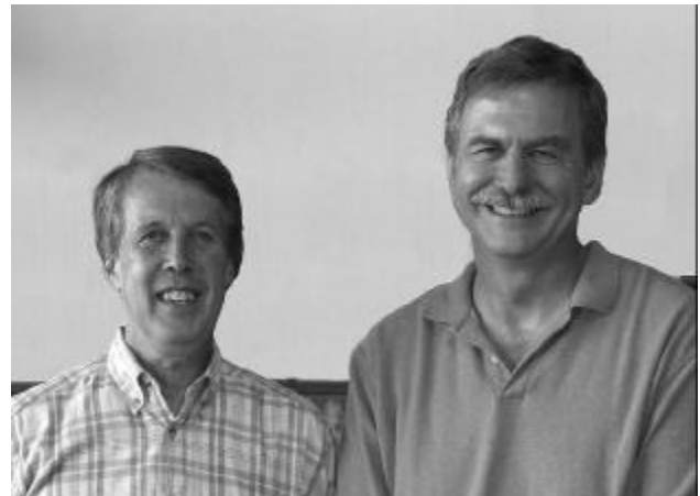
New Life Masters Win Friday afternoon Pairs

The annual Holiday Party will be held at the Millenium Hotel on Sunday, December 7.